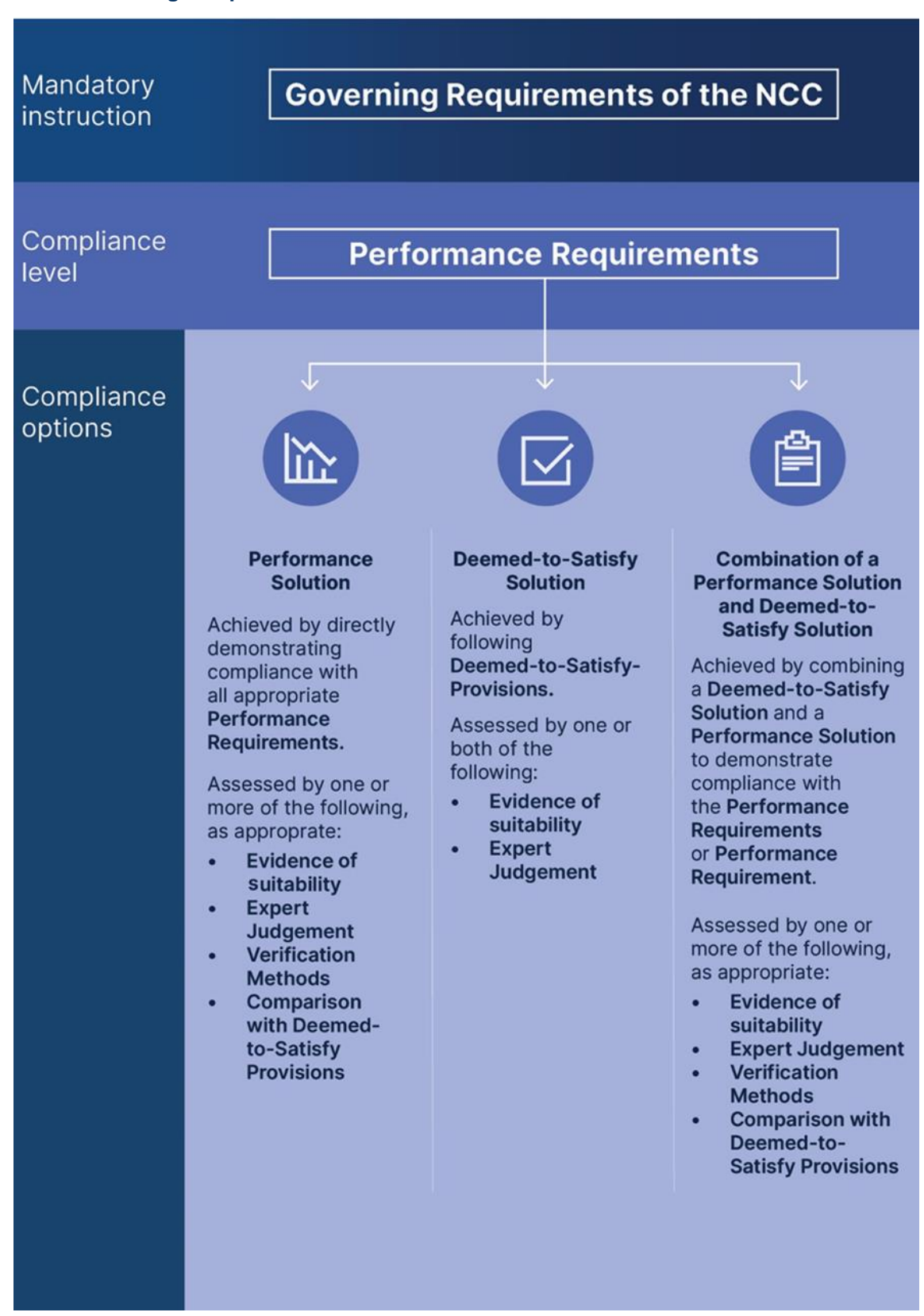
Figure C.1 Demonstrating compliance with the NCC